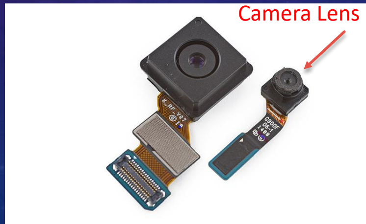
Sample camera module